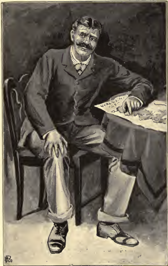
The tourist at the Grapes Inn, Maentwrog.